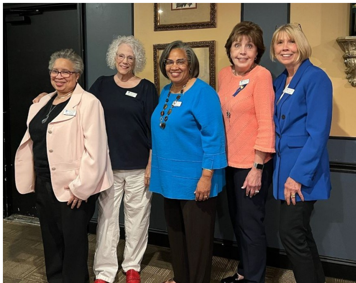
The Service Objectives Committee

The representatives from each organization were able to meet other groups that approach helping women and girls in different ways. There were a lot of business cards exchanged and ideas shared. It is the best night of our club year.