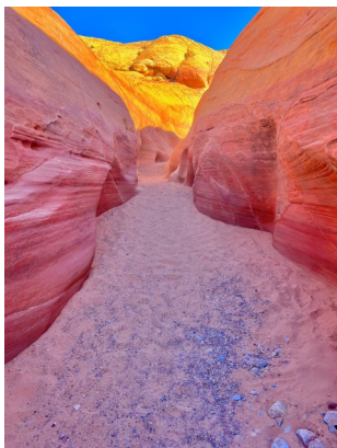
Below L-R: Valley of Fire, Cactus Garden in Joshua Tree, Sunset in Death Valley.