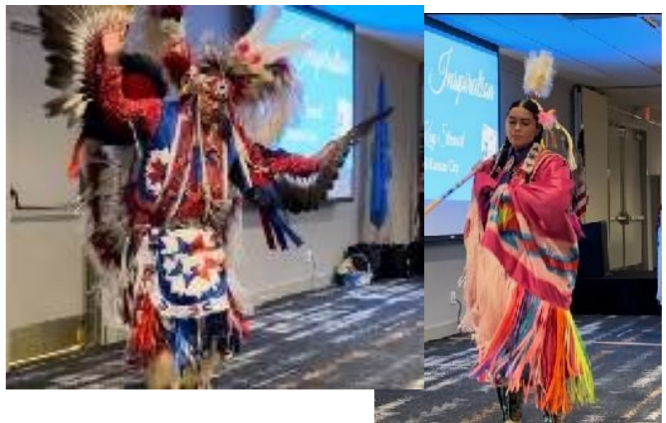
“Wow, Look at those shoes!”