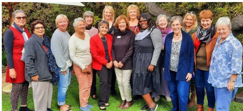
Soroptimist International Cape of Good Hope, South Africa

As a service organisation we have at times struggled to attract younger professional women to join us. Modern technology has opened up our meetings to an international audience which in turn has provided us with a range of interesting and informative speakers. This has attracted younger professional women to participate and become interested in the project work of Soroptimist International whose focus is the improvement of the lives and status of women and girls through education, empowerment and enabling personal development. We look forward to the future of continuing with the technology of Zoom for our meetings, to inspire younger members to join and the opportunity to charter new Virtual Clubs.