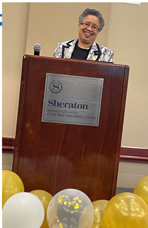
Governor Grace welcoming everyone.