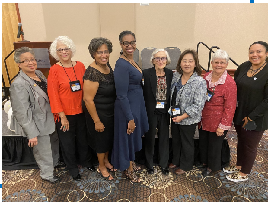
SIKC club all dressed up for Saturday night's festivities.