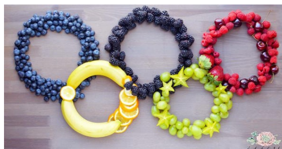
Olympic Fruit Platter